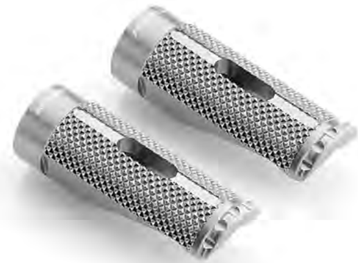
"PRO" Rider / Passenger pegs for OEM Controls Kits TÜV