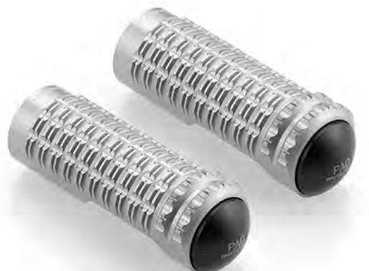
"B-PRO" Rider / Passenger pegs for OEM Controls Kits PATENT TÜV