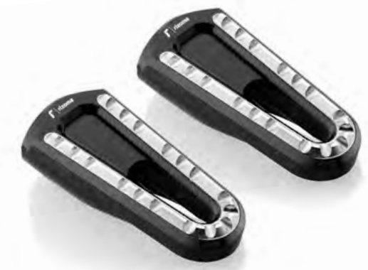
"STREET" Rider / Passenger pegs for OEM Controls TÜV